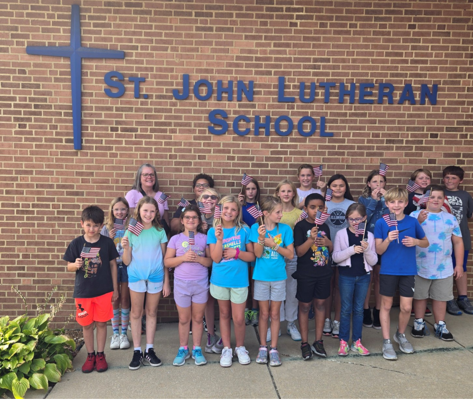
Students and educator at St. John Lutheran School after a successful flag presentation by The American Legion.

DEC 7: PEARL HARBOR DAY BIG 4 MEETINGS 75% ALA TARGET DATE DEC 14: SAL WINTER D.E.C. (DEPT) DEC 24: CHRISTMAS EVE (OFFICE CLOSED) DEC 25: CHRISTMAS DAY (OFFICE CLOSED) DEC 31: NEW YEAR'S EVE 80% CUTOFF