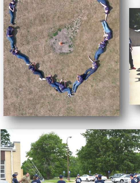
The Youth Police Program, Illinois State Police and National Guard teaches trust, confidence, strength and how to work together as a TEAM!