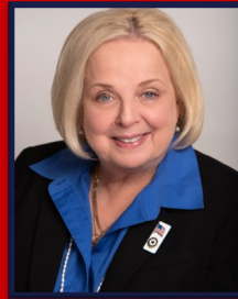
Department Auxiliary President