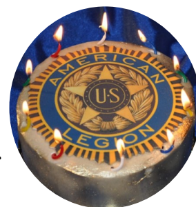
Legion Birthday is March 16th

The national organization has made a kit available to help guide posts on Buddy Checks.