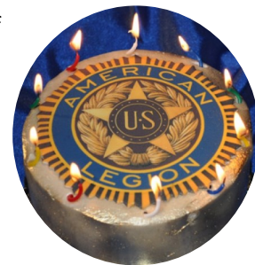
Legion Birthday is March 16th

The national organization has made a kit available to help guide posts on Buddy Checks. The online resource contains information about Buddy Checks, tips, answers to FAQs and downloadable resources such as a flyer, scripts and more. Posts are encouraged to share their Buddy Check successes on the Legiontown website .