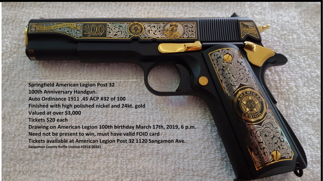
Springfield American Legion Post 32 100th Anniversary Handgun. Auto Ordinance 1911 .45 ACP #32 of 100 Finished with high polished nickel and 24kt. gold Valued at over $3,000 Tickets $20 each Drawing on American Legion 100th birthday March 17th, 2019, 6 p.m. Need not be present to win, must have valid FOID card Tickets available at American Legion Post 32 1120 Sangamon Ave. Sangamon County Raffle License #2818-00341

American Legion Post 32 Attn: Gun Raffle 1120 Sangamon Avenue Springfield, Illinois 62702-1853