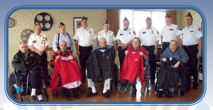
Lake Zurich Post #964 members deliver gifts to the veterans of Lexington Healthcare Center.

For God and Country we thank you for your support!