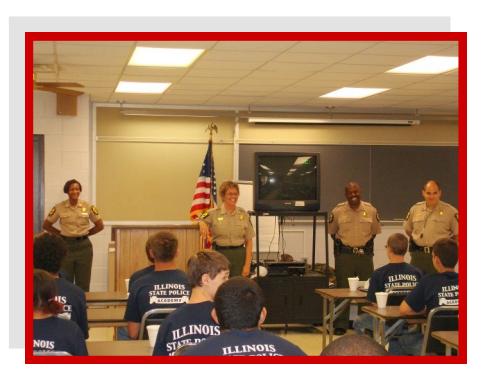
Illinois State Police Officers enjoy class time too!