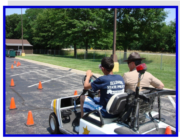
Drunk Driver Simulation