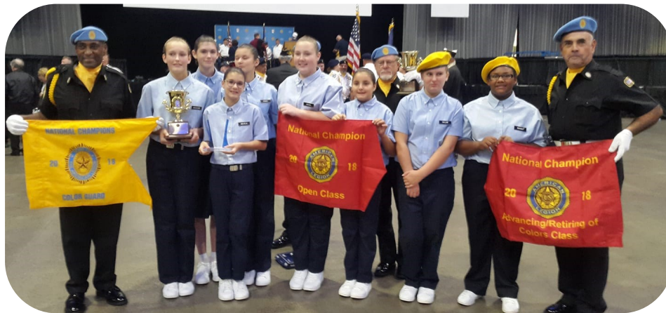
100th National Convention—Junior Color Guard Champions