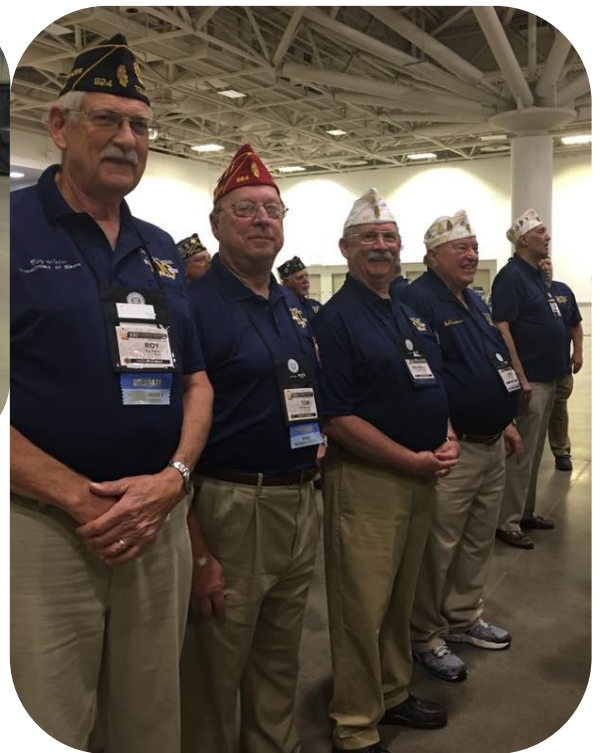
100th National Convention Parade Department of Illinois Leadership