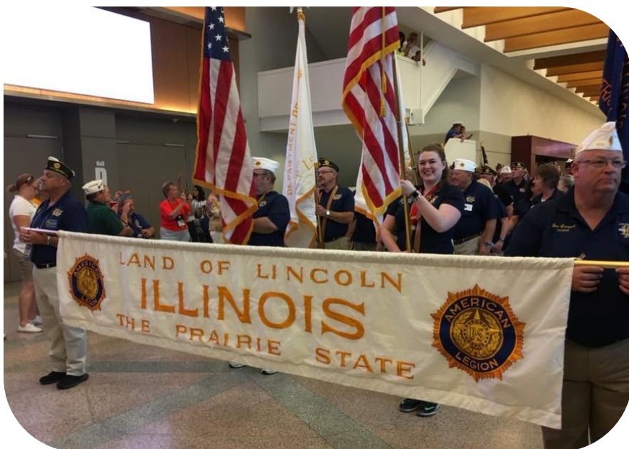
100th National Convention Parade Illinois Delegation