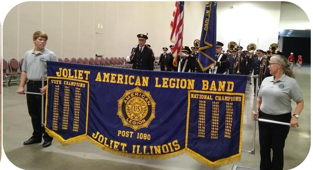
100th National Convention—Joliet Band Champions