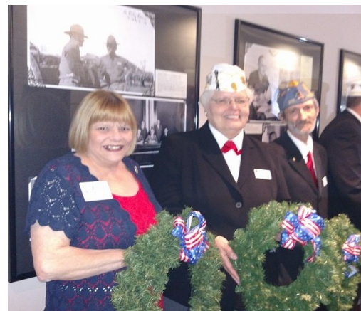
Legion Family presenting a wreath during the Truman Pilgrimage.

I would ask that you all continue to work with your Auxiliary and make Illi-