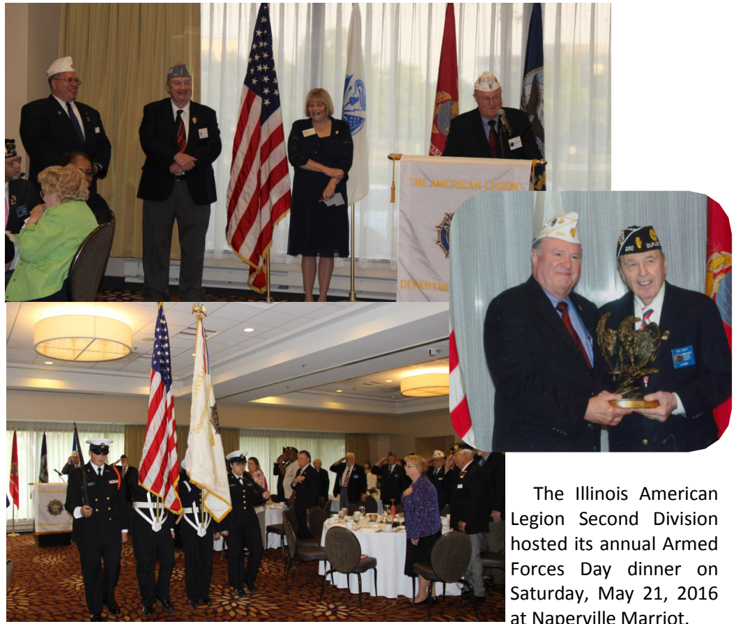
The Illinois American Legion Second Division hosted its annual Armed Forces Day dinner on Saturday, May 21, 2016 at Naperville Marriot.