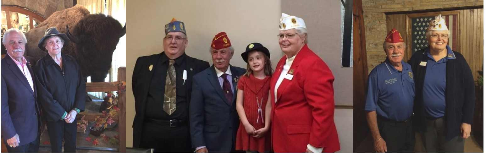
(Pearl Harbor continued from page 10)

The Legion Family past and present spent the weekend in Carbondale. The weekends events include a tour of the Marion Veterans Administration Medical Center. Friday evening Steak fry. Saturday Open House at The Haven and banquet at the Carterville Community Center. Sunday morning schedule are meetings for the Past Commanders & Past Presidents followed by the annual Egyptian Past Commanders Club at The Haven.